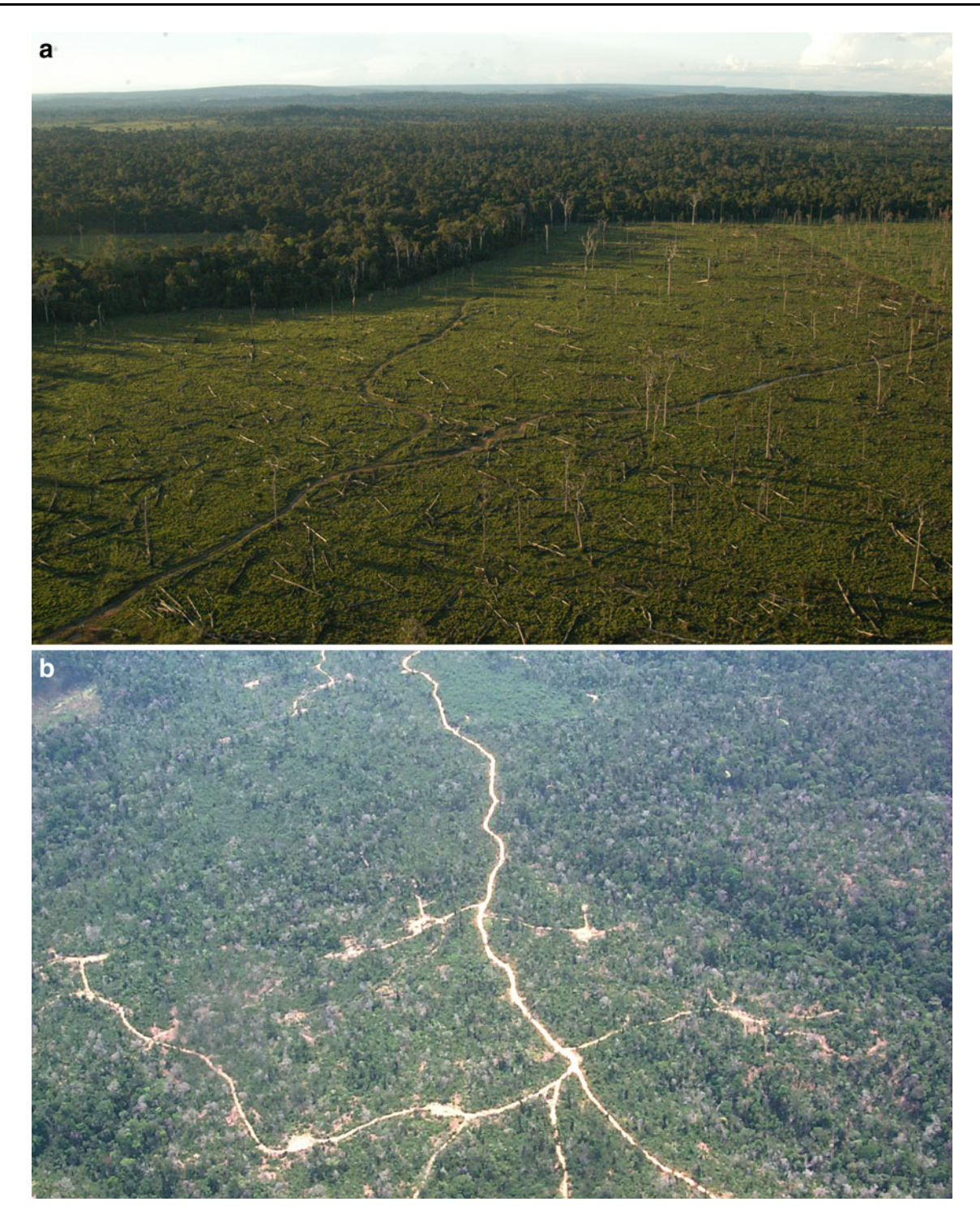
Fig. 2 a Airborne photo of clear cutting probably for pasture—note the felled logs are still on the ground. b Airborne photo of a degraded forest, the result of 'super-logging'. This will not be counted in the deforestation statistics.

development of the region, the sometimes ambivalent national policies and the global situation with respect to energy supply and food availability that are likely to determine future trends in the deforestation. Payments for carbon services may occupy a place in the panoply of measures; however, to be attractive such compensation approaches will