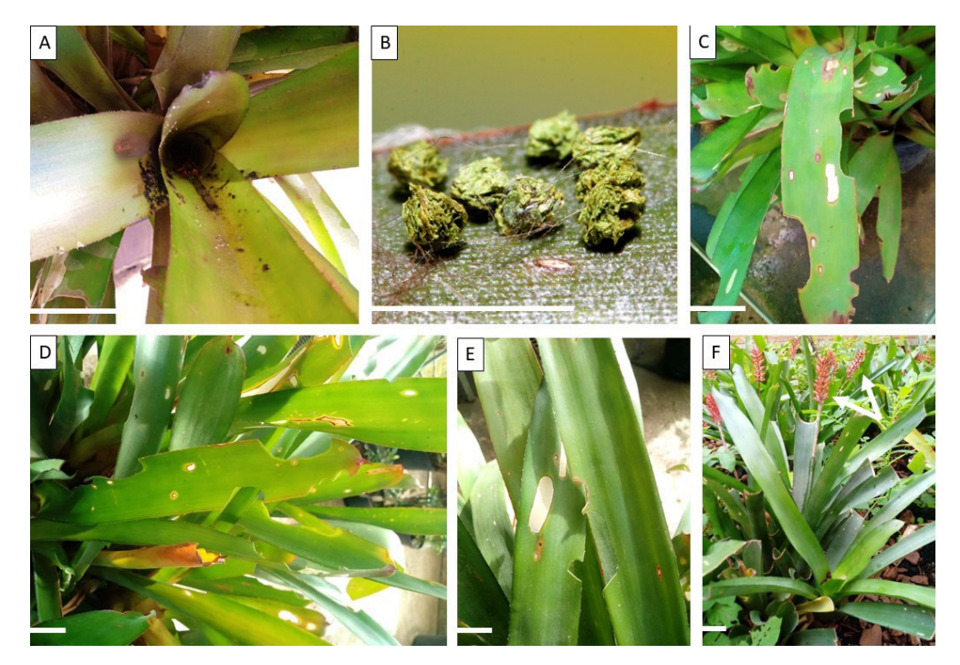
Figure 2 Leaves infested with larvae of Calodesma collaris (Lepidoptera: Erebidae) (A) larvae excrements (B). Damaged leaves of Aechmea winkleri (Bromeliaceae) (C-D-E). Plant without damage displaying a health inflorescence (white arrows) (F). Scale: 1 cm.