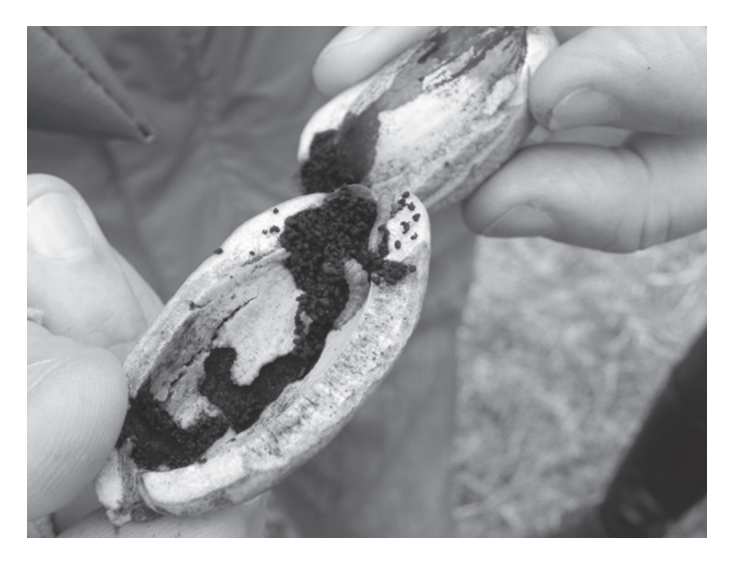
Fig. 2. Larva of Gymnandrosoma aurantianum and injury to pecan pericarp.

Gymnandrosoma aurantiana is known in Brazil as the citrus fruit borer, and became a key pest by the end of the 1980s, when larval injuries on fruits became serious damage, and compromised the use of fruits for industry or for consumption in natura, resulting in loss of production up to 50% (Prates 1992; Parra et al. 2004; Carvalho et al. 2015). This led to research efforts aimed at lowering losses, and basic studies on biology, rearing techniques, monitoring, and use of egg parasitoids, which resulted in parameters for G. aurantiana pest management, particularly in the state of São Paulo, the largest citrus producer in Brazil (Garcia & Parra 1999; Vilela et al. 2001; Parra et al. 2004; Bento et al. 2006; Molina & Parra 2006). In Mexico, the egg parasitoid Trichogramma platneri Nagarkatti (Hymenoptera: Trichogrammatidae) was effective in pecan orchards when the abundance of tortricidae C. caryana was low or moderate (García-Nevárez & Tarango-Rivero 2013).