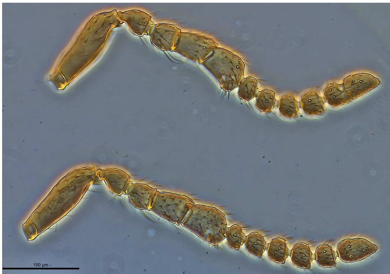
Figure 4. Telenomus dilophonotae , male both antennae.

in the literature, regarding cassava hornworm species E. ello and E. alope (FARIAS & BELLOTTI 2006), with highlight to the first species, which represented 95.81% of adult specimens. Both species were previously related in cassava at the State of Pará with higher frequency from October to April, with E. ello occurring in small populations and E. alope with rare encounters (SILVA & CARNEIRO 1986).