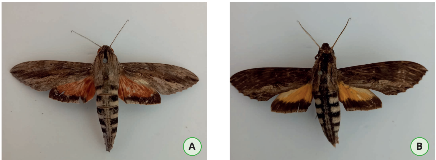
Figure 2. Erinnyis ello (A) and Erinnyis alope (B).

of 16.39%, while at pupae stage was of 6.37%. The sex ratio considering specimens in pupae stage was of 0.52. Out of the 191 specimens which reached adult stage, 95.81% were identified as E. ello and 4.19% as E. alope (Figures 2A, B). In 87.5% of the collects, the presence of E. ello was observed whilst the presence of E. alope was only observed during June, August, September and December, with low incidence.