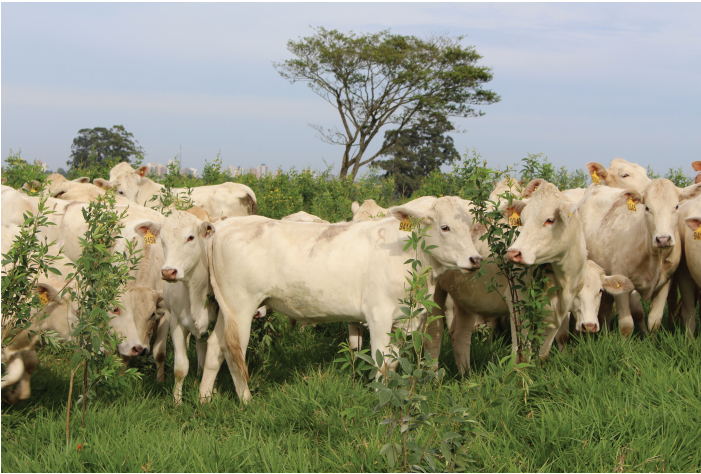
Figure 1. Canchim breed heifers in an Uroclaea brizantha pasture enriched with Cajanus cajan cv. BRS Mandarin legume.

prairie—water purification, flood mitigation, climate stabilization, and biodiversity—while revitalizing rural communities decimated by farm consolidation. INIA-PAP is testing four crop-livestock (beef) rotations, representative of the predominant commercial livestock strategies in Uruguay, with the aim of evaluating four ways of producing 400 kg LW/ha per year that is economically, environmentally, and operationally viable (Rovira et al., 2020). UWP-PF is investigating the effects of alternative dairy production systems on water quality and nutrient cycling. Dairy 1 is evaluating breeds and crossbreeding for once-a-day milking (Jiang et al., 2020) and the use of precision technology to feed cows more efficiently (Duranovich et al., 2021). HAUF is mapping the impact (economic, environmental, and social indicators) of conversion from separate crop and livestock enterprises to a mixed circular crop-livestock farming system. HRC has identified the cultural, practical, and economic barriers to better soil and nutrient management in ruminant systems (Gibbons et al., 2014; Rhymes et al., 2021).