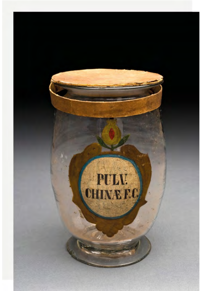
Figure 11.1 Glass pharmacy jar containing powdered quinine. Source: Unknown maker, Wellcome Collection. The jar is believed to be from the pharmacy of the Milosrdnych Bratri Monastery and Hospital Brno, in the Czech Republic. The painted label written in Latin indicates that this glass pharmacy jar contained powdered quinine. In: https://wellcomecollection.org/works/ycqazud9

Like many other historical and contemporary products, the history of the quinas connects the Andes and the Amazon with the world at different times. This history is made up of religious, commercial, and scientific controversies. For example, debates have taken place for centuries as to whether Indigenous peoples knew about its medicinal properties (see for example, Ruiz 1792 or von Humboldt 1821); in this regard, there is increasing evidence that knowledge was transmitted from natives to Jesuits (Estrella 1994; Ortiz Crespo 1994; Crawford 2016). An erroneous history that has circulated widely, up until the present day, refers to the fact that the Countess of Chinchón was cured of malaria with powders of Cinchona bark and then she distributed it to the peoples of Lima. Today we know that this story is full of errors, beginning with the supposed participation of the Countess (Haggis 1941). However, it served the purpose of validating the medicine among the nobility and the people. The first European explorer to describe these plants was the French academic Charles Marie de La Condamine, who sent specimens to Linnaeus (de la Condamine [1738] 1986). The Swedish botanist gave that Latin name to the plants, convinced of the legend of the Countess of Chinchón. Shortly