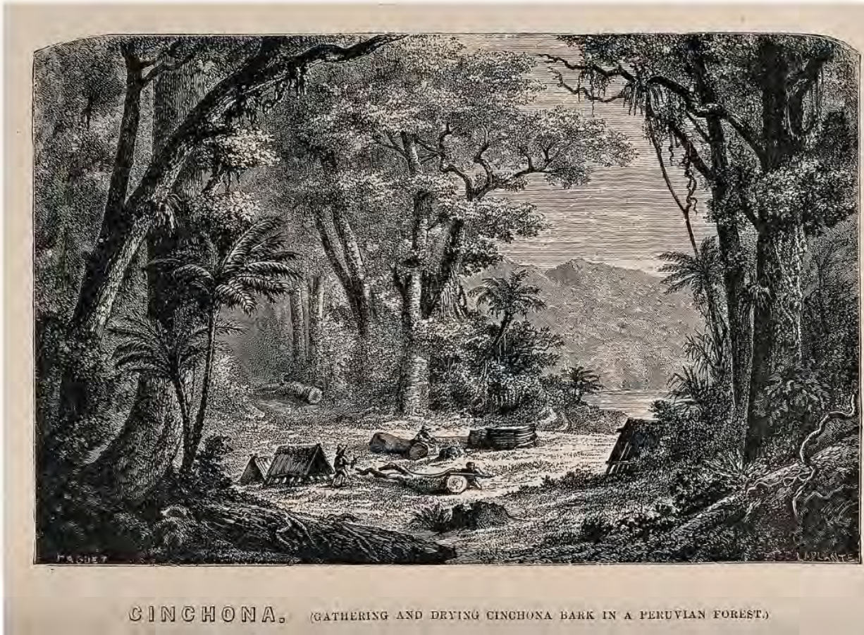
Figure 11.3 Gathering and drying of Cinchona bark in a Peruvian forest. Source: Wood engraving, by C. Leplante, c. 1867, after Faguet. Wellcome Collection. https://wellcomecollection.org/works/werf33s3

dersson 1998; Zárata Botía 2001; Maldonado et al. 2017). As in Colombia, the use of this species laid the foundations for the subsequent exploitation of rubber, by involving the native population in its exploitation, defining an economy strongly based on free access and low-cost labor.