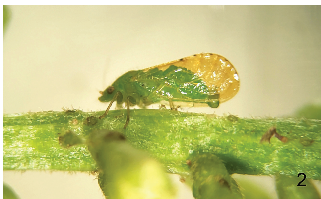
Figures 1 and 2. Auchmerina limbatipennis . 1. Female, with dark wing band; 2. Male, without dark wing band.