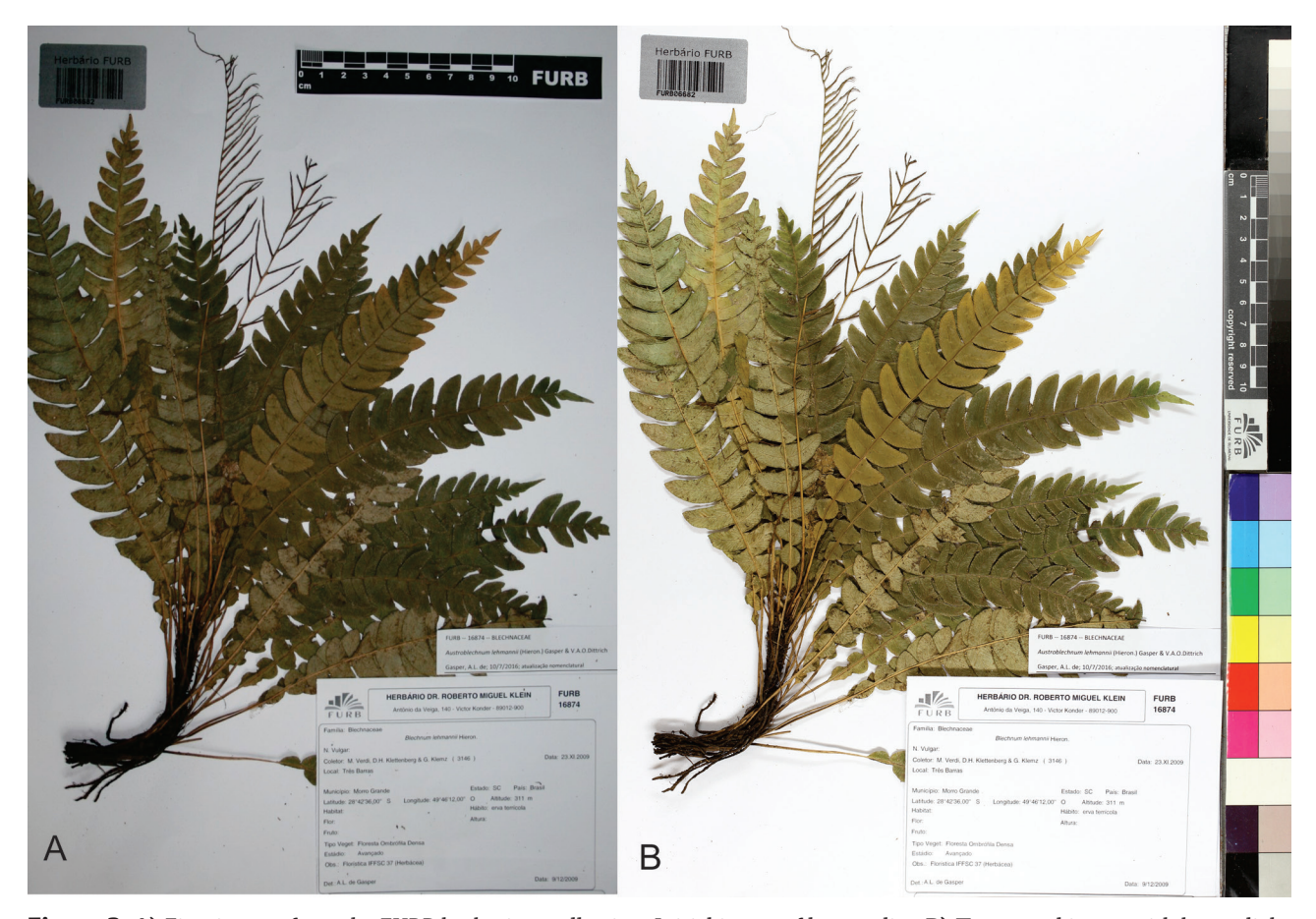
Figure 3. A) First images from the FURB herbarium collection. Initial image of low quality. B) The second image with better light and camera equipment.

FURB (Herbário Dr. Roberto Miguel Klein, Universidade Regional de Blumenau, Blumenau, Santa Catarina) is new relative to many other Brazilian herbaria (Gasper et al. 2014). The collection was created in the 1900s and began to be better structured in 2003. A large and systematic project (Floristic and Forest Inventory of Santa Catarina state; Vibrans et al. 2010) resulted in its exponential growth from 2007 to 2012. The digitization process began when FURB had 40,000 specimens (now the collection has 69,976). A professional camera and support designed by the herbarium staff were first used (Fig. 3A), and one sample of each species (~8,000) was photographed. Then, with Reflora and