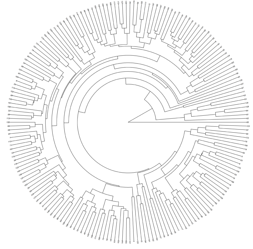
Figure 1: Genotypes grouping of the cultivar 'ES8152' and clonal witnesses A1 (191), LB1 (192), V8 (194) and V12 (193) by UPGMA hierarchical method, based on the Standardized Euclidean Distance matrix, from morphoagronomic characteristics and vegetation index. Bananal do Norte Experimental Farm, INCAPER.

and, or, molecular data from the Incaper research program (Ferrão et al., 2009; Ferrão et al., 2017; Ferrão LFV et al., 2019; Ferrão et al., 2021; Fonseca et al., 2006; Giles et al., 2018; Senra et al., 2020; Souza et al., 2021), demonstrating the presence of genetic variability to be explored. The genetic materials identified as divergent, in the UPGMA, Tocher and principal coordinates clusters, must be monitored for their agronomic characteristics over at least four harvests for selection and use per se and, or, in hybridizations in the INCAPER breeding program. The obtaining these results, in the initial phase of experimentation, are important to guide selection and recombination strategies focused on the formation of heterotic groups for controlled crosses. Additionally, the direct selection of superior genotypes is a fundamental strategy in the composition of trials to determine the value of cultivation and use (VCU), followed by the launch of new cultivars. According to Borém and Miranda (2013) and Ferrão MAG et al. (2019), crosses involving genetically different parents can produce a high heterotic effect and the breeder can obtain hybrids or clones superior to the paternal.