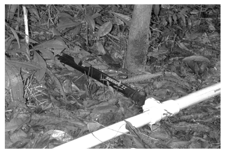
Figure 1. Irrigation system implanted in irrigated treatment in the successional forest at the UFRA Station, Castanhal/PA

In the irrigated treatment, 5 mm of water/day were added for about 30 minutes during the dry season in the late afternoon with irrigation hoses (Santeno), systematically allocated in the central plots (Figure 1). The amount of daily irrigation applied corresponded to the estimation of regional evapotranspiration per day, in secondary forest in the Amazon (Lean et al., 1996; Jipp et al., 1998; Sommer et al., 2002).