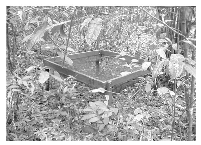
Figure 2. Litter collector in control treatment, installed 30 cm above the soil surface, in successional forest, Castanhal/PA

The collectors measured 1 m<sup>2</sup> (1 m \times 1 m) and 0.10 m in depth, suspended from the ground at 0.3 m. The sampling frequency was weekly in order to reduce the nutrient leaching process in samples which were still in the collector (Proctor, 1983) (Figure 2).