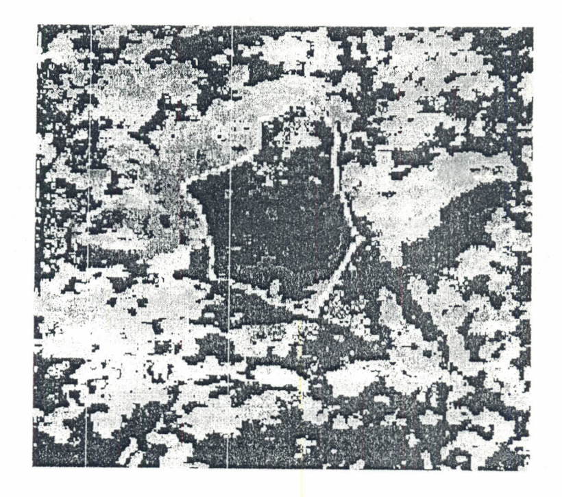
Figure 1. Emas National Park by NOAA/AVHRR Imagery