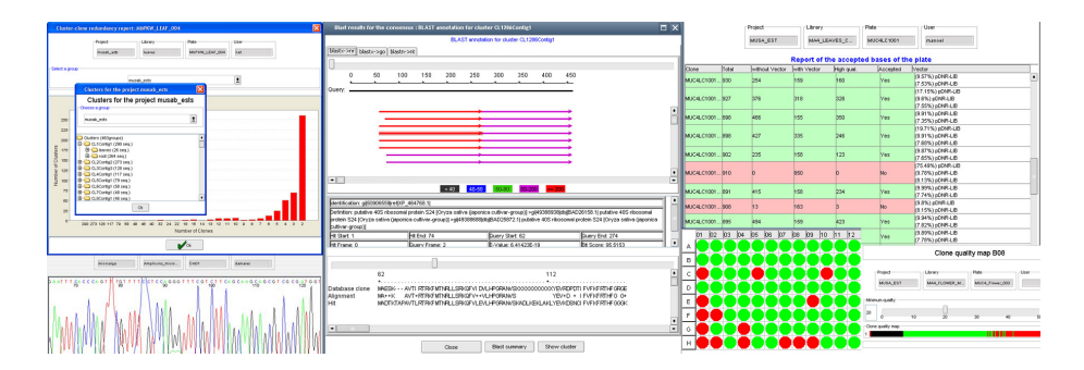
Fig. 2. Screenshot of several features available on SisGen showing clustering population, sequence analysis, chromatogram viewer, blast output analysis tool, plate quality visualization and clone quality map.

The client can navigate through various levels of project and sequence information, querying and gathering data from the server through the coordination of a business delegate 14 , that hides client-server remote communication details (Fig. 1 ) reducing coupling between the presentation and logic layers.