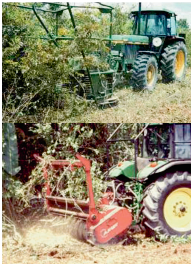
Fig. 3: Newly developed bush chopper (upper) and forest mulcher FM 600 (AHWI Maschinenbau GmbH, Herdwangen, Germany; lower) at work

Screening experiments were conducted with a set of maize, rice, cowpea and cassava cultivars in mulched plots with and without the use of fertilizer. In the case of cassava, fertilizer means the residual fertilizer of the previous crops. The screening results show that on mulched plots all cultivars, as expected, yielded better with the application of fertilizer. However, there appears to be some scope in overcoming the unfavorable growth conditions on mulched plots without fertilization through the use of adapted rice and cassava cultivars. The yields of the not-fertilized rice cultivars range around the local average. Yield differences between the cultivars could be found (although statistically not significant) which might be exploited through further breeding. The relatively small differences between cassava tuber yields under conditions with and without residual fertilizer might also be overcome by further selection or breeding. This does not hold true for cowpea and maize for which all tested cultivars are poorly suited to the growth conditions under mulch and, thus, require fertilizer application.