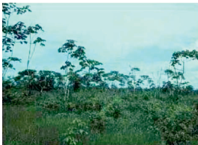
Fig. 2: Fallow vegetation in the Bragantina region following traditional cropping (left) and black pepper cultivation (right)