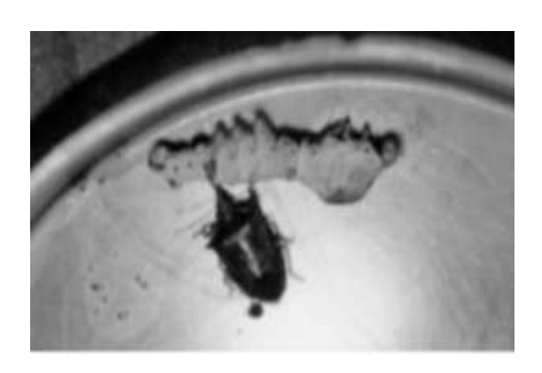
Figure 3 - The predator Podisus rostralis (Heteroptera: Pentatomidae) attacking the prey Bombyx mori (Lepidoptera: Bombycidae).

Most P. rostralis attacks were made in the posterior part of prey body although some individuals attacked, without success, the head area of B. mori . When stylets were inserting into prey body (first attack), the prey reacted with violent body movements with its head pointed to the predator. Prey sometimes escaped from predator attack (Fig. 4).