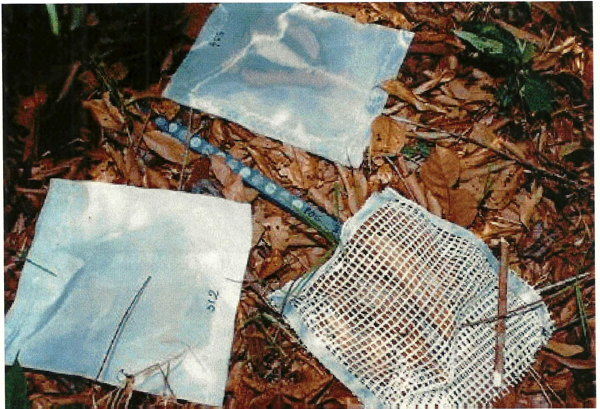
Figure 2: Litter bags and minicontainer exposed in the field.