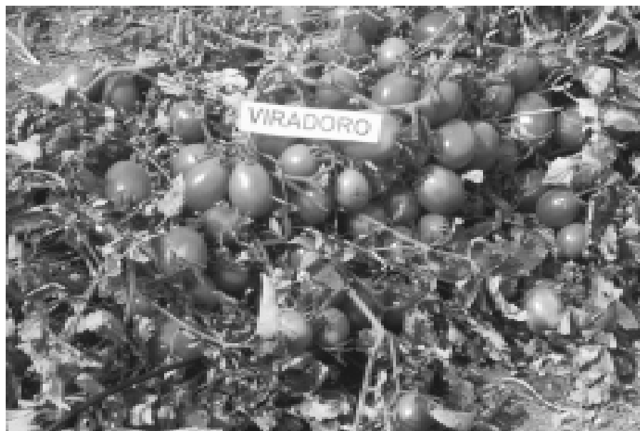
Fig. 2. Plants and fruits of the processing tomato cultivar Viradoro.

'Viradoro' has been also evaluated in large plots within production fields at several locations in Goiás and Minas Gerais States (central Brazil). In these commercial fields (conducted under either center-pivot or overhead sprin-