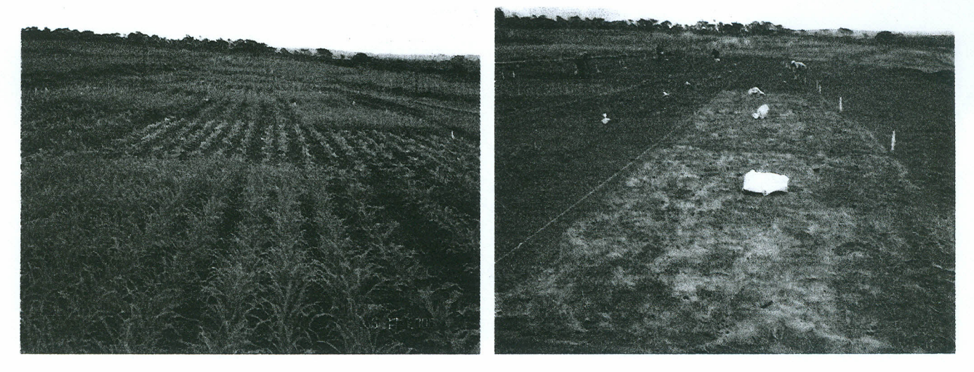
Fig 1. General aspects showing the Biotite schist applied on the soil surface (left) and pearl millet and soybean growing in the field (right).