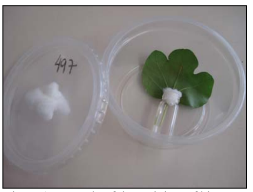
Figure 1. Example of the recipient of bioassay

Each set of vial and cotton leaf received 10 second instar nymphs of A. gossypii from a laboratory colony and was placed in a plastic recipient of 500 ml (Figure 1). Each recipient was identified with the strain used and the replication number. The bioassay was placed in a environmental-controlled room at a temperature of 26^{\circ} C \pm 2 , 78% \pm 2 air humidity and photophase of 12 h. Dead and living aphids were counted and recorded after five days. A control treatment was conducted using sterile water without any strain of bacterium and a level of 10% mortality was established for the threshold of a valid assay. The strains that presented mortality rates higher than 50% was selected and compared each other throughout an analysis of variance.