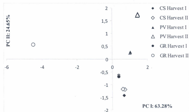
Figure 2. PCA obtained from 18 red wine samples analyzed by GC-FID in two harvest dates, in June (Harvest I) and November (Harvest II) of 2009, for the determination of the higher alcohols. PC1 x PC2 explained 87,93% of the total variability. CS: Cabernet Sauvignon; PV: Petit Verdot; GR: Grenache.

For red wines, the results were different as compared to the white ones (Figure 2). PC1 x PC2 explained 87.93% of total variability. Cabernet Sauvignon (CS) wines elaborated in June and November presented similarities, the climate conditions didn't change the aromatic profile. The compounds responsible were identified as 3-metil-1-butanol and ethyl acetate. Petit Verdot (PV) also presented little differences, being wines from November (Harvest II) characterized by higher concentrations of ethanal than Petit Verdot from June (Harvest I). This fact can be explained by higher temperatures in the second semester and collaborated to increase the oxidation of the wines (Peynaud, 1997). Only wines from Grenache (GR) presented big differences according to the month of winemaking. Grenache from June (Harvest I) presented 3-metil-1-butanol as aromatic marker, in the negative side of PC2, while Grenache from November (Harvest II) presented 2-metil-1-butanol in higher concentrations. Red wines had different responses as compared to white wines, that were more influenced by climate conditions.