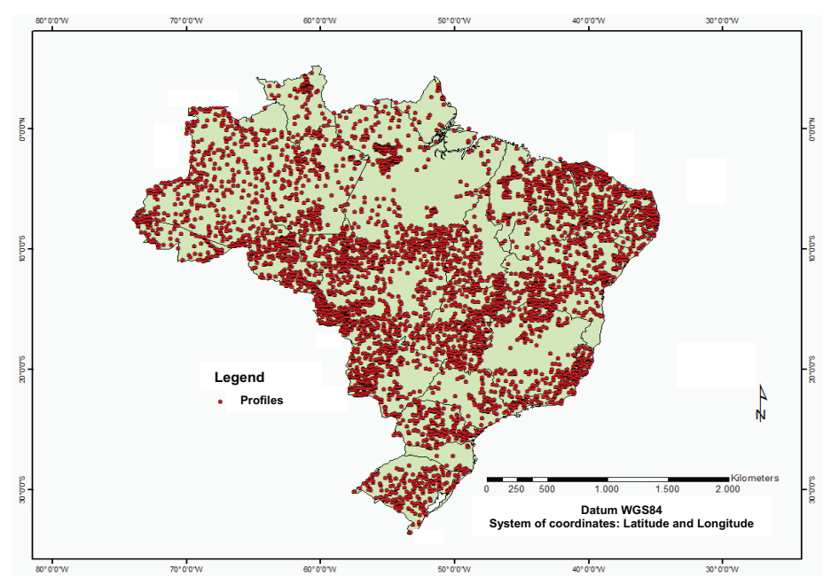
Fig. 1. Brazil map showing the political division and locations of the soil profiles used in the study

The works which originated the database came from official soil surveys chosen to assure the total coverage of the Brazilian territory. They were published between 1960 and 1986 by the former Soil's Conservation and Survey National Service (SNLCS-Embrapa), previous institutions, and the RADAM Brazil Project as described in table 1.