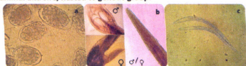
Figure 1. Gastrointestinal helminth eggs (a); structures of adult Haemonchus spp (b) and infective larvae of gastrointestinal helminths (c)

✓Statistics: the total EPG and EPG data by parasite genus were transformed to log 10 (n + 1). The data were analysed using the MIXED PROCEDURE of the Statistical Analysis Systems Institute (SAS, 2002/2003). The REPEATED measures analysis of PROC MIXED was used for EPG and PCV data. The fixed effects included in the model were genetic group, month/year of collection and interaction. The random variables fitted were animal and sire, nested to genetic group.