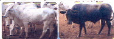
Figure 2. Nelore animal (a) and animal born of cows Canchim ½ + ¼ Nelore inseminated with Angus (b).