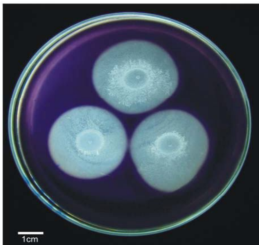
Figure 3. Amylolytic capacity of the rhizobial isolate 47.3b, that presented the higher enzymatic index among the 27 rhizobial isolates evaluated.