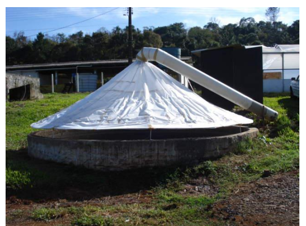
Figure 1. Dynamic chamber installed above the manure storage pit to continuous assessment of the emission of CH_4 , CO_2 and N_2O .