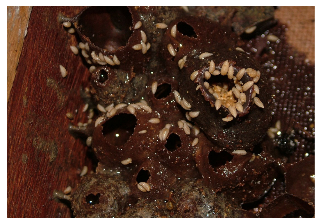
Figure 1. A dead colony of M. marginata infested with larvae of P. kerteszi , most of them walking and feeding on the honey and pollen pots. (In colour at www.bulletinofinsectology.org)

In Brazil, many beekeepers use traps based on commercial vinegars of red wine, which is thought to be better than traps based on white wine vinegars, but again, there are no published studies evaluating the efficacy of these vinegars on attracting phorid flies. There are also some criticisms to these vinegars traps. The criticisms are based on the possibility the traps would attract phorid flies that are outside the nest, because of their acid odour, thus increasing infestations (Souza et al. , 2009).