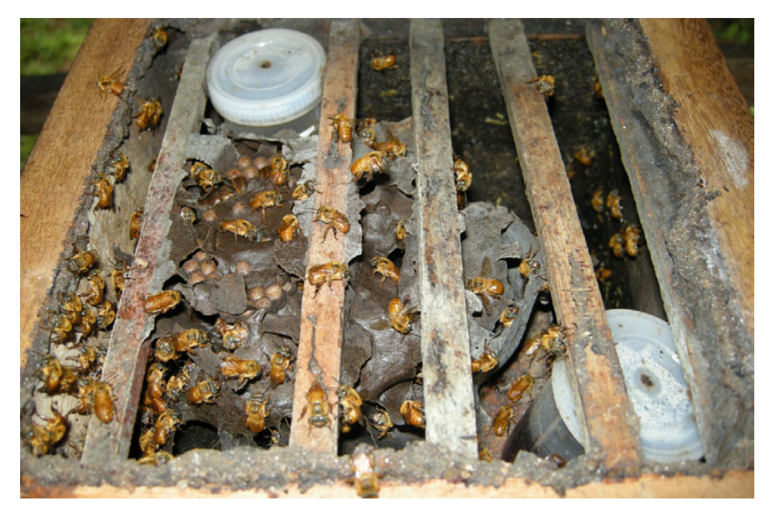
Figure 2. Phorid traps composed of red wine (bottom right) and white wine vinegars (upper left), being removed from a colony of M. flavolineata , after a week inside the colonies. Notice the holes on the top of the vials are closed with cerumen. (In colour at www.bulletinofinsectology.org)

of time the workers inside the colony normally close the trap hole with cerumen, thus not allowing more captures of phorid flies. After the seven-day period, the traps were removed and the identification of the phorid flies captured in each trap was done. Twenty-six trials were performed for M. fasciculata colonies and 13 for M. seminigra . The comparisons of the amount of phorid flies attracted on each trap, per bee species, were performed by using a Wilcoxon matched-pair test (Zar, 1999), with a significance level of 5%.