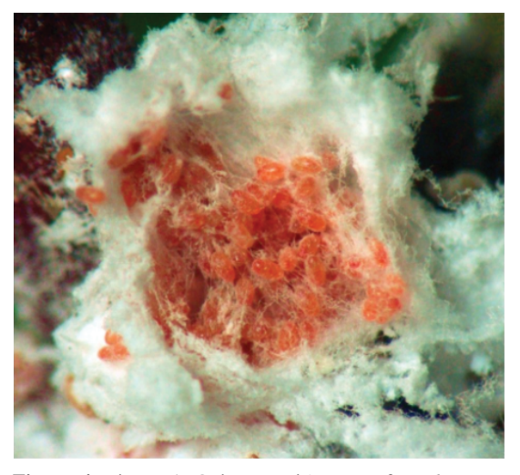
Figure 4. Figure 4. Ovissaco with eggs of M. hirsutus .