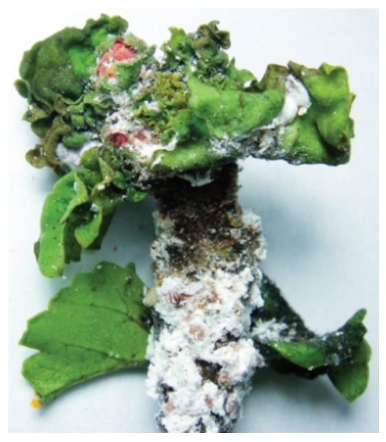
Figure 5. Colony of M. hirsutus on leaves, shoots and floral buttons of the H. rosa-sinensis .