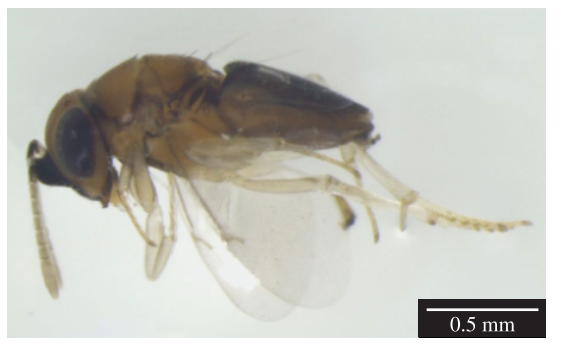
Figure 6. Adult female of A. kamali , hymenopteran parasitoid associated with M. hirsutus .