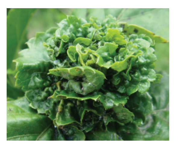
Figure 3. Typical injury presented by host plants infested by M. hirsutus , 'bunchy-top' deformation.