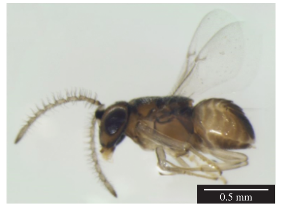
Figure 7. Adult male of A. kamali , hymenopteran parasitoid associated with M. hirsutus .