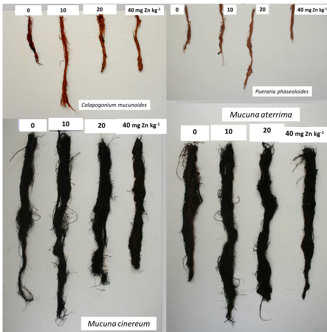
Figure 2. Root growth of selected cover crops at different soil Zn levels.

Zn concentration (content per unit dry matter), Zn uptake (concentration \times dry matter) and Zn use efficiency (dry weight per unit of Zn uptake) were significantly influenced by Zn level and cover crop ( Tables 8-10 ). Overall, Zn concentration increased in a quadratic manner with the addition of Zn to the soil from 0 to 40 \text{mg}\cdot\text{kg}^{-1} ( Y = 18.23 + 6.14X - 0.09X^2 , R^2 = 0.98^{**} ). The Zn concentrations in the cover crop shoots at various soil applied Zn levels were comparable to Zn concentrations reported for other legumes [28]. The Zn concentration of smooth crotalaria was always higher than the others and was two times higher than the average at the 40 \text{mg}\cdot\text{kg}^{-1} level.