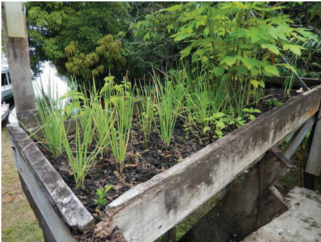
Figure 1. Traditional use of charcoal pieces (biochar) to enhance soil to cultivated horticultural crops in the Amazon