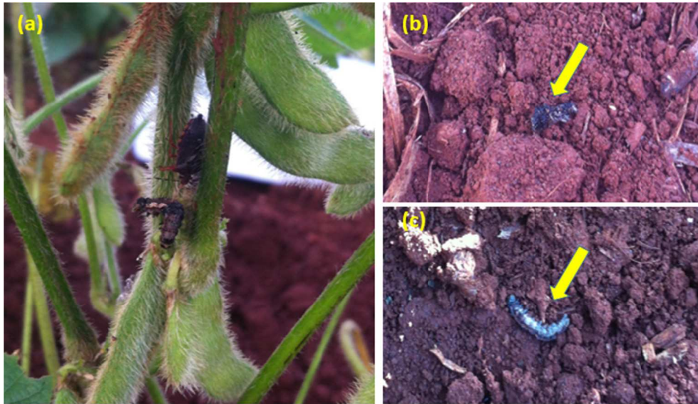
Figure 1. (a) Adult female of Podisus nigrispinus preying on Helicoverpa armigera caterpillar and (b, c) H. armigera caterpillars predated by P. nigrispinus in field on soybean crop.

Adult females preyed on average 2.26 caterpillars within 24 hours and fifth-instar nymphs preyed on 1.73 caterpillars/day, presenting statistical difference (Figure 2).